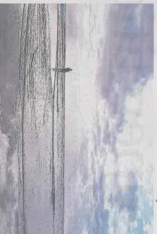
WARM UP: Trousers Point on Flinders Island (left); Wybalenna Chapel (top) and Camerons Inlet.

Beach House and the Furneaux Tavern in Lady Barron, which has a wood heater in the restaurant. www.flindersisland.com.au and www.visitflindersisland.com.au